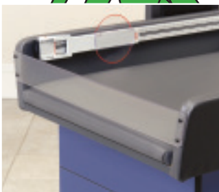
6 Top Rimmed on 3 Sides